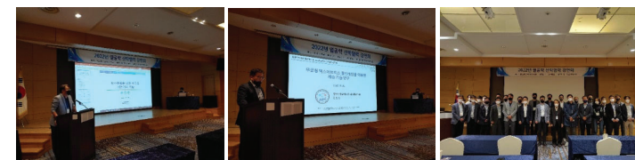
Fig. 2.2 Industry-Academia Joint Lectures

This seminar became an opportunity for 30 researchers in addition to 6 presenters to share various technical discussions and exchanges. The seminar is an annual event hosted by KSME TED. It was held on-line last year due to Covid-19 and then this year, it was held off-line again, so the enthusiasm for participation was high. In 2023, it is expected that the industry and academia will gather together again to become a venue for exchange on various topics related to thermal engineering.