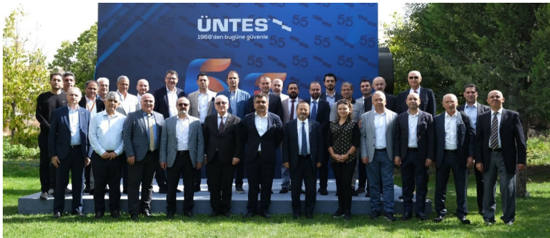
ASHRAE TURKISH CHAPTER- FACTORY VISİT – ÜNTES-RHOSS 28 SEPTEMBER 2023

HVAC-R INDUSTRY EXPORTERS ASSOCIATIONS (ISIB)