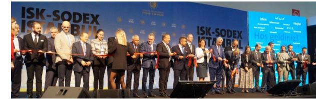
ISK-SODEX Istanbul 2023

Turkish Society of HVAC and Sanitary Engineers (TTMD)