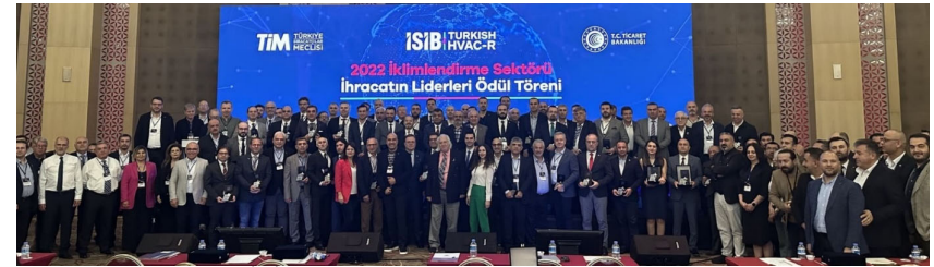
Turkish HVAC-R ISIB Sector Strategy Workshop, Antalya, November 2 nd , 2023.

HVAC-R INDUSTRY EXPORTERS ASSOCIATIONS (ISIB)