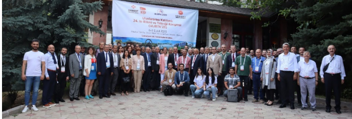
24 th Congress of Thermal Sciences and Technology (ULIBTK'23), Baskent University, Ankara

A total of 701 papers were applied to the congress. The sessions, which were held in parallel in 5 different halls, continued for 3 days, and apart from the technical sessions, the studies prepared by the congress sponsor NUMESYS company for the congress were discussed in a special session.