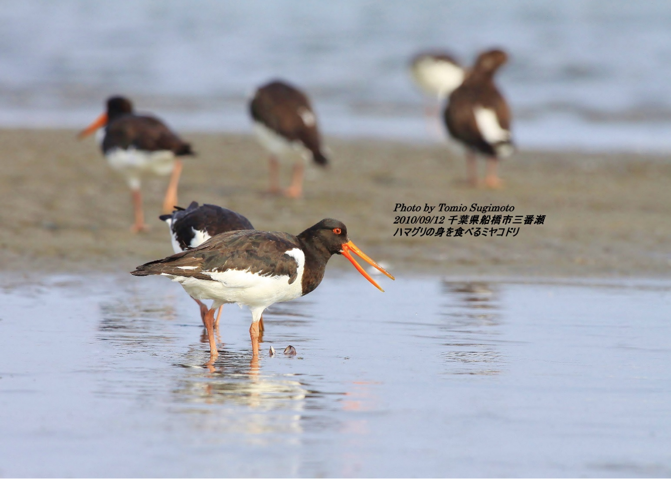
2010/09/12 千葉県船橋市三番瀬 ハマグリを食べるミヤコドリ