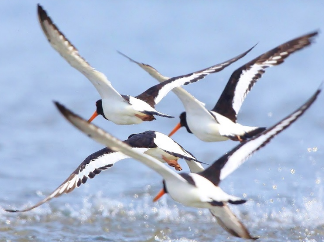
2010/09/12 千葉県船橋市三番瀬 東京湾に飛び立つミヤコドリ