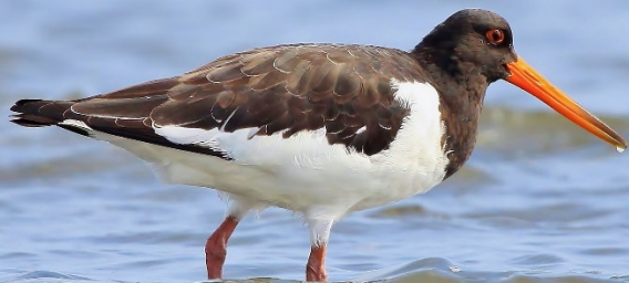
2010/09/12 千葉県船橋市三番瀬 東京湾で越冬するミヤコドリ