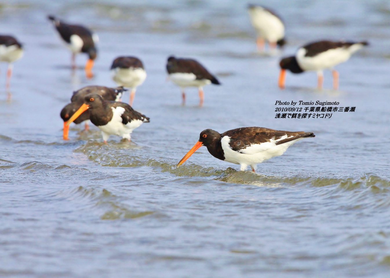
2010/09/12 千葉県船橋市三番瀬 浅瀬で餌を探すミヤコドリ